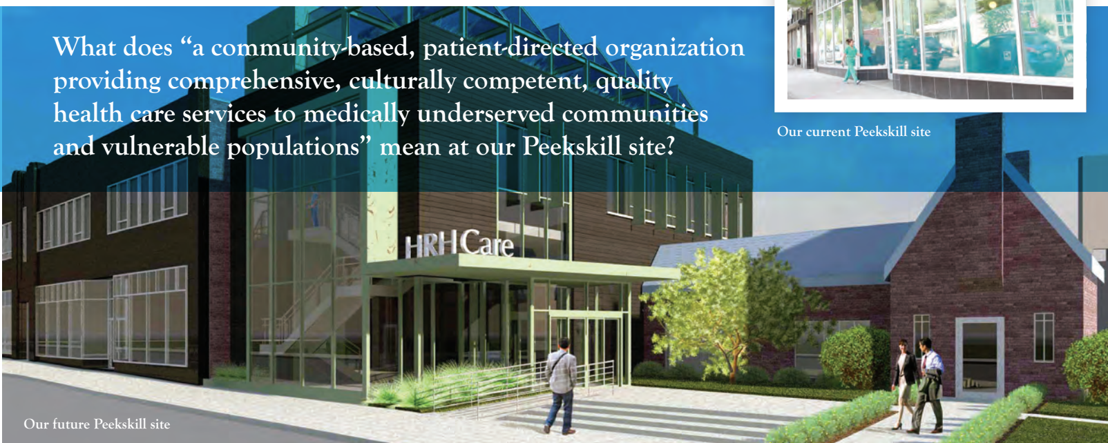
Our future Peekskill site

What does “a community-based, patient-directed organization providing comprehensive, culturally competent, quality health care services to medically underserved communities and vulnerable populations” mean at our Peekskill site?