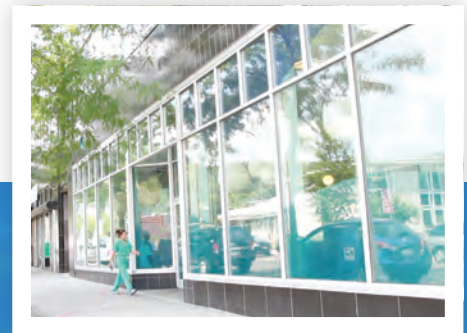
Our current Peekskill site

HRHCare Peekskill staff-137 strong- served 13,181 patients who visited our facility 55,575 times in 2012. This included 531 prenatal visits to our Women's Health Department- one of which ended with the unexpected delivery of a beautiful baby boy right at our health center! HRHCare continues to offer care as families grow. Our Women, Infant & Children (WIC) program served 1600 children at nutritional risk in 2012 to provide food vouchers, nutrition education and health care referrals for low-income families and children up to age 5. From children to geriatrics and everyone in between, our pediatric and internal medicine departments provide both primary and specialty medical care to those who are unable to afford healthcare. We serve those who do not have insurance, or are underinsured and we never turn anyone away because of their inability to pay.